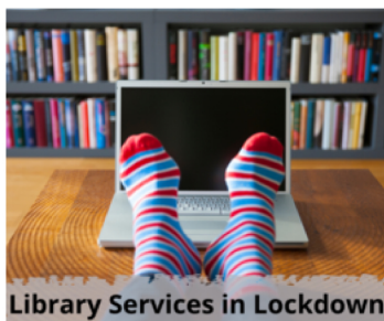
Library Services in Lockdown